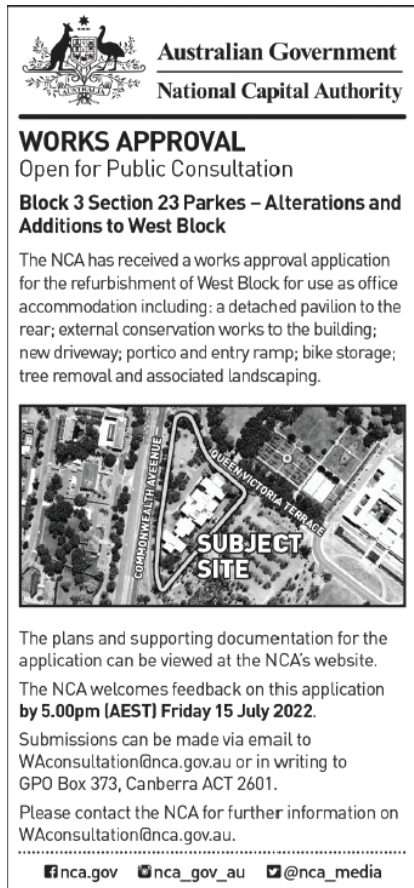
Canberra Times advertisement