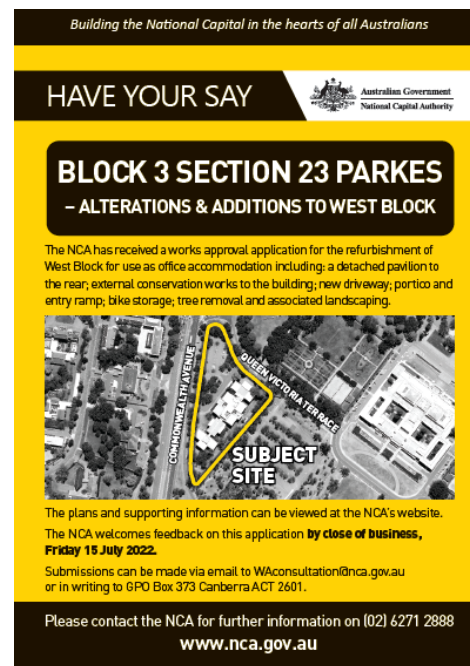
On site signage