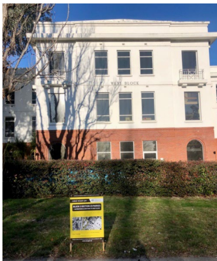
Signage in situ