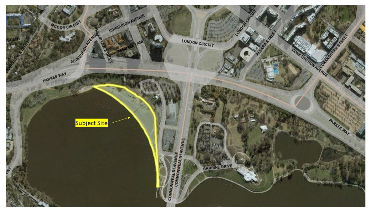
Figure 2: Site Plan