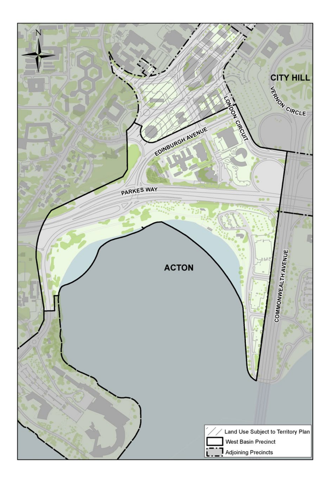
Figure 3 Precinct location