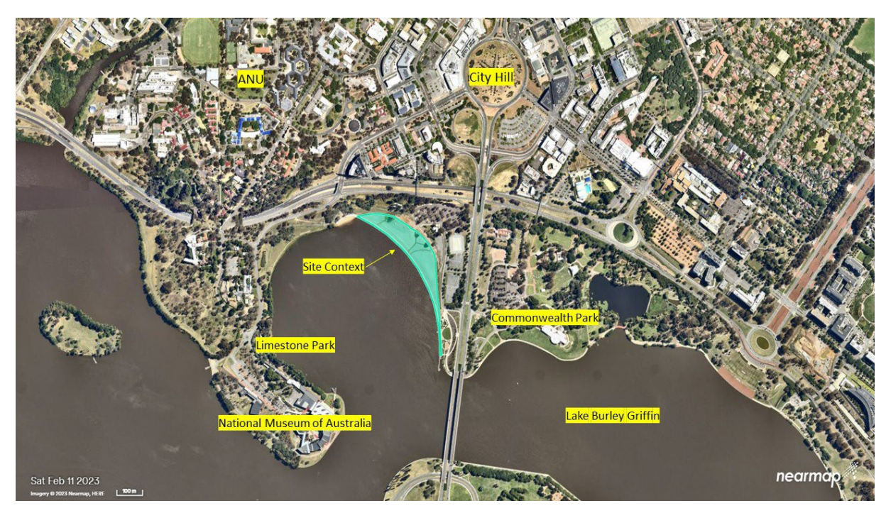
Figure 1: Site Context