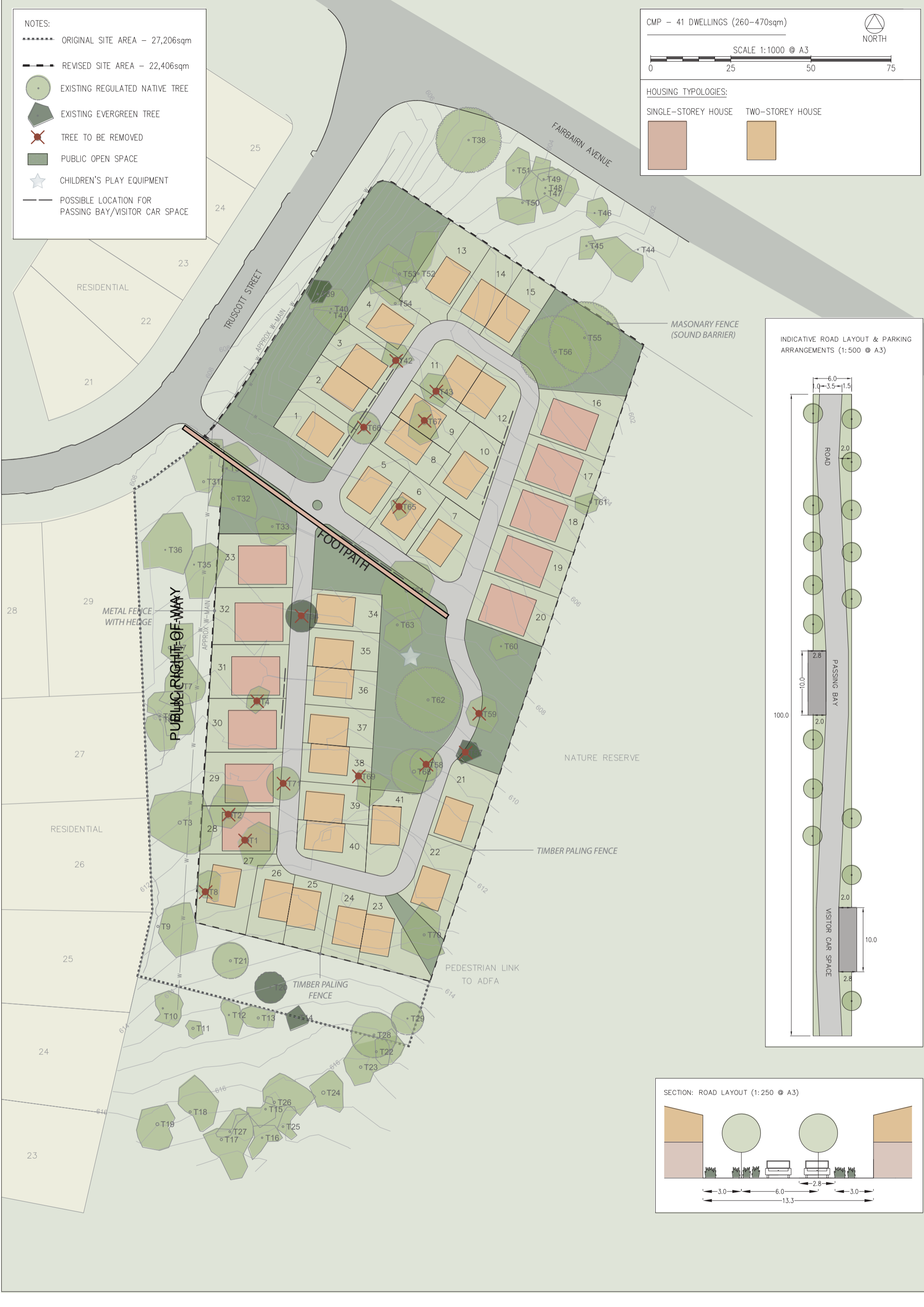
INDICATIVE ROAD LAYOUT & PARKING ARRANGEMENTS (1:500 @ A3)