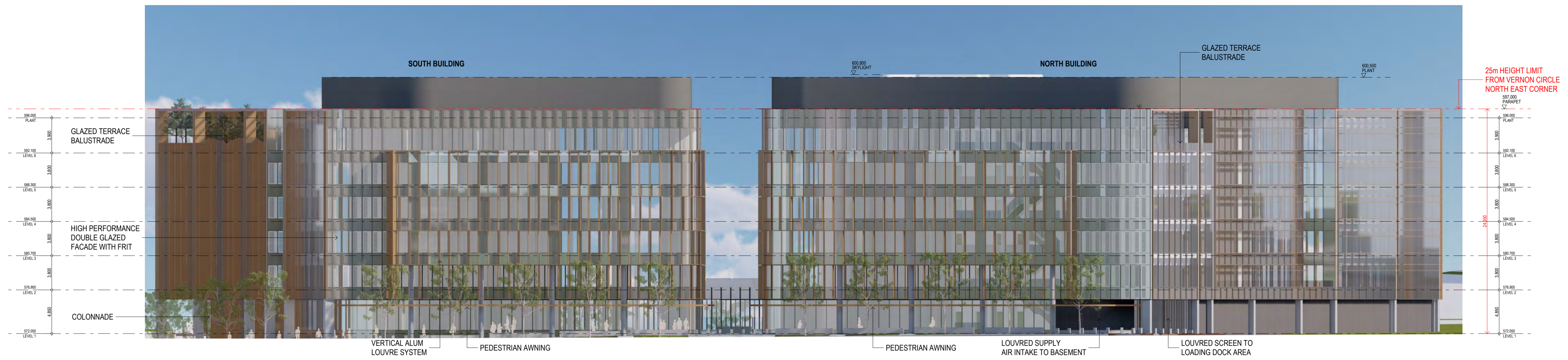
COLOURED ELEVATION - EAST (VERNON CIRCLE)