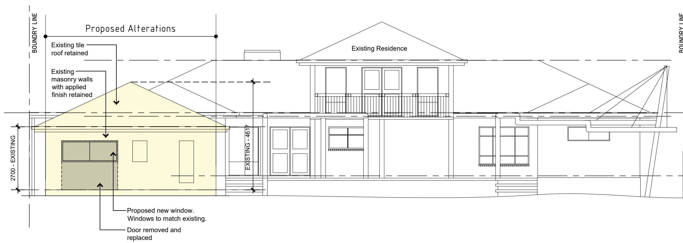
Elevation 2 1:100