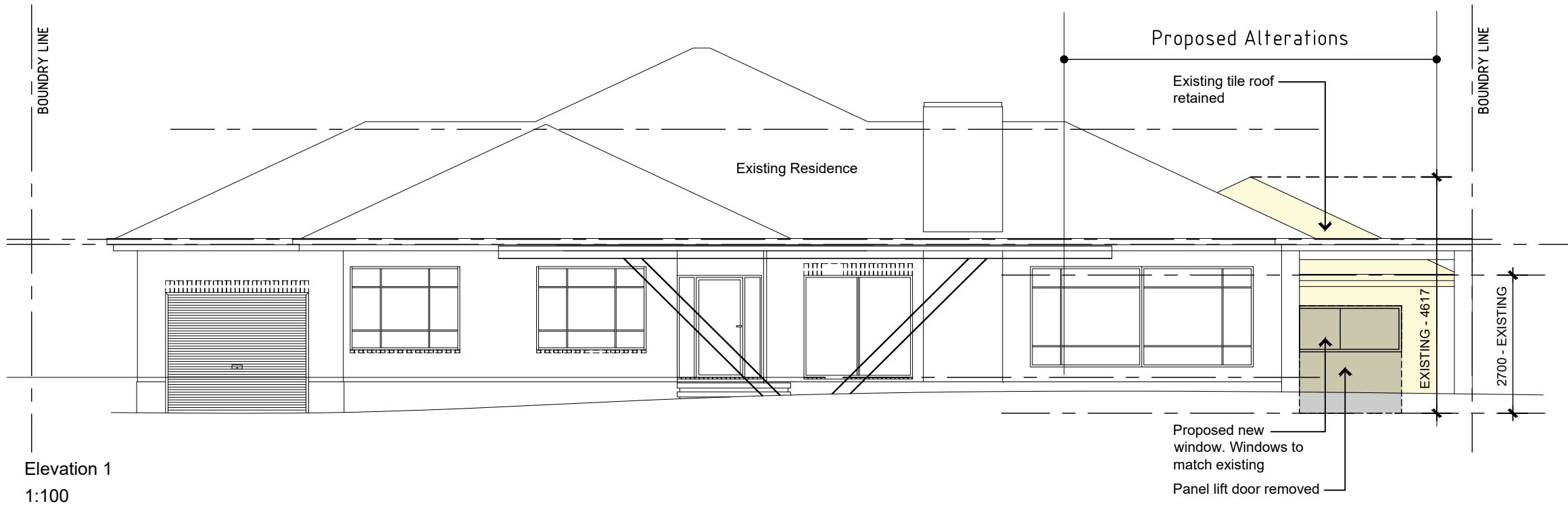
Elevation 1 1:100