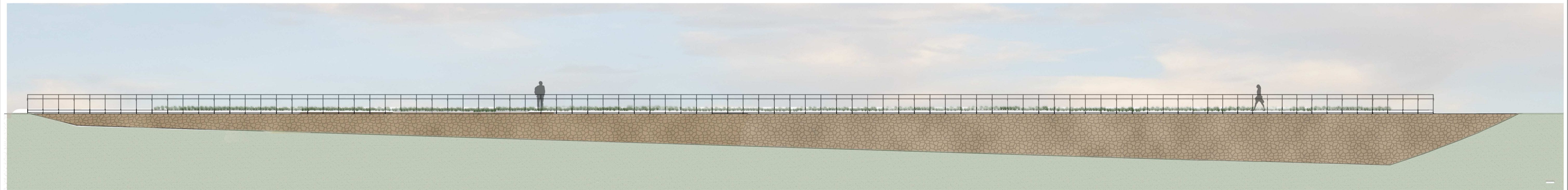
2 ELEVATION - RETAINING WALL B Scale: 1 : 125