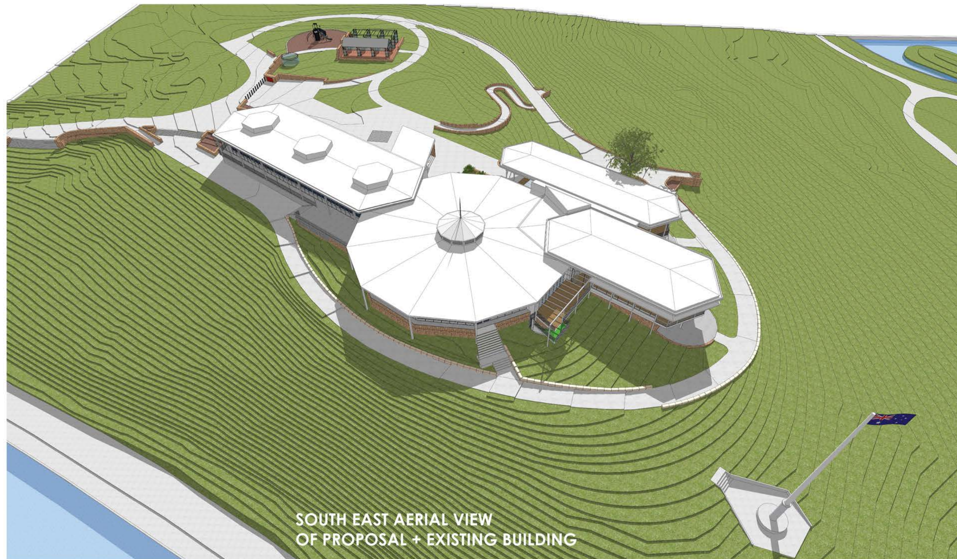
SOUTH EAST AERIAL VIEW OF PROPOSAL + EXISTING BUILDING