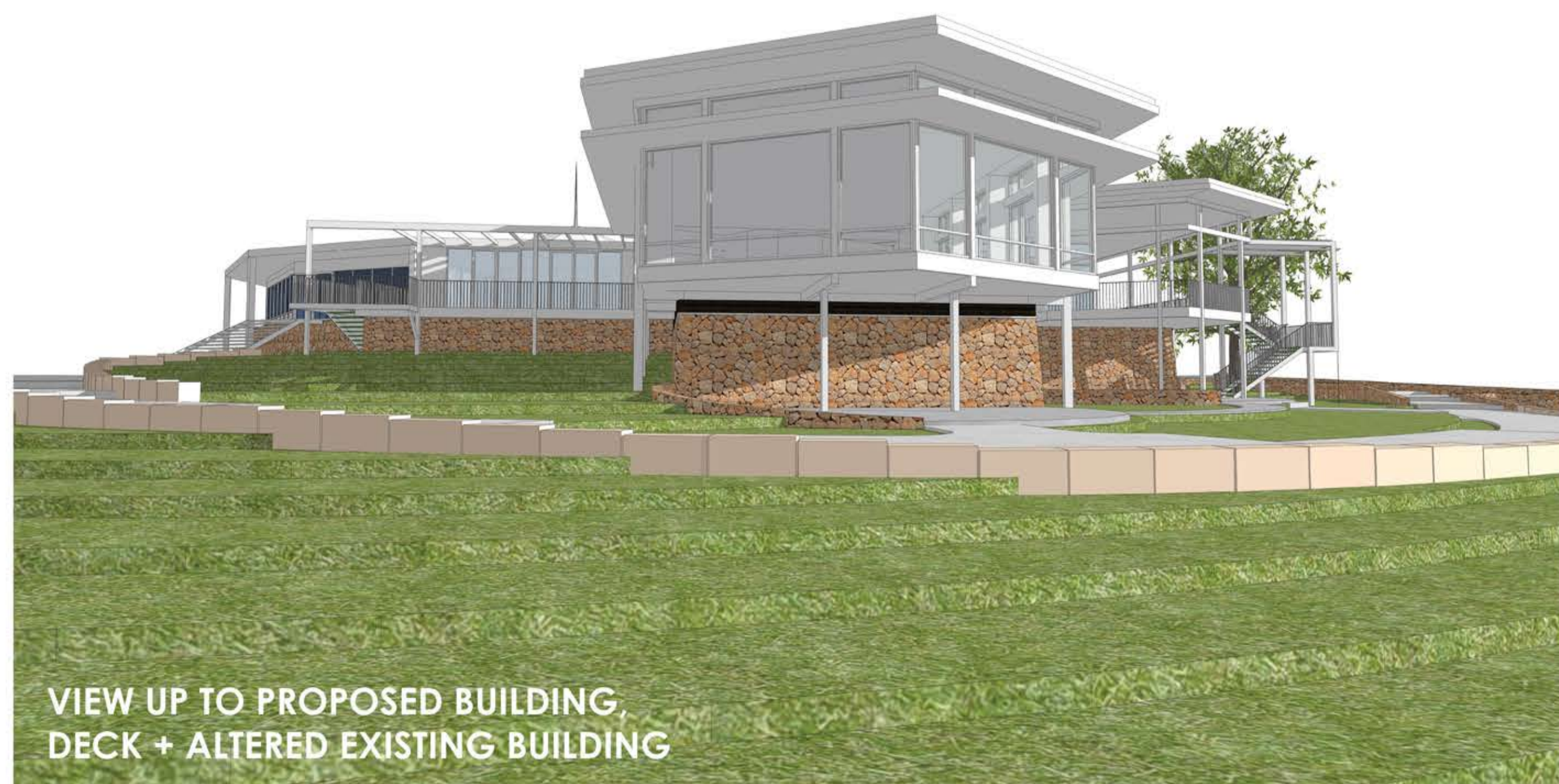
VIEW UP TO PROPOSED BUILDING, DECK + ALTERED EXISTING BUILDING