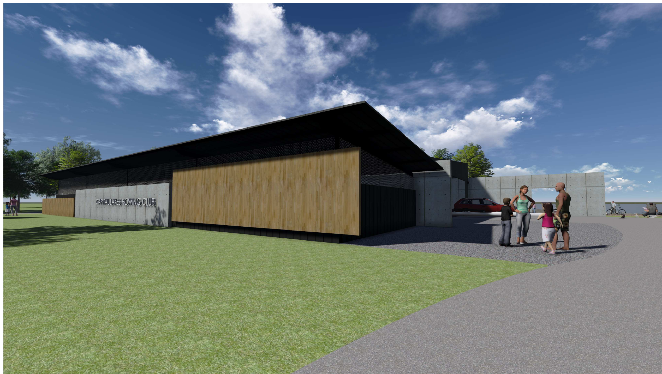
3 AERIAL VIEW