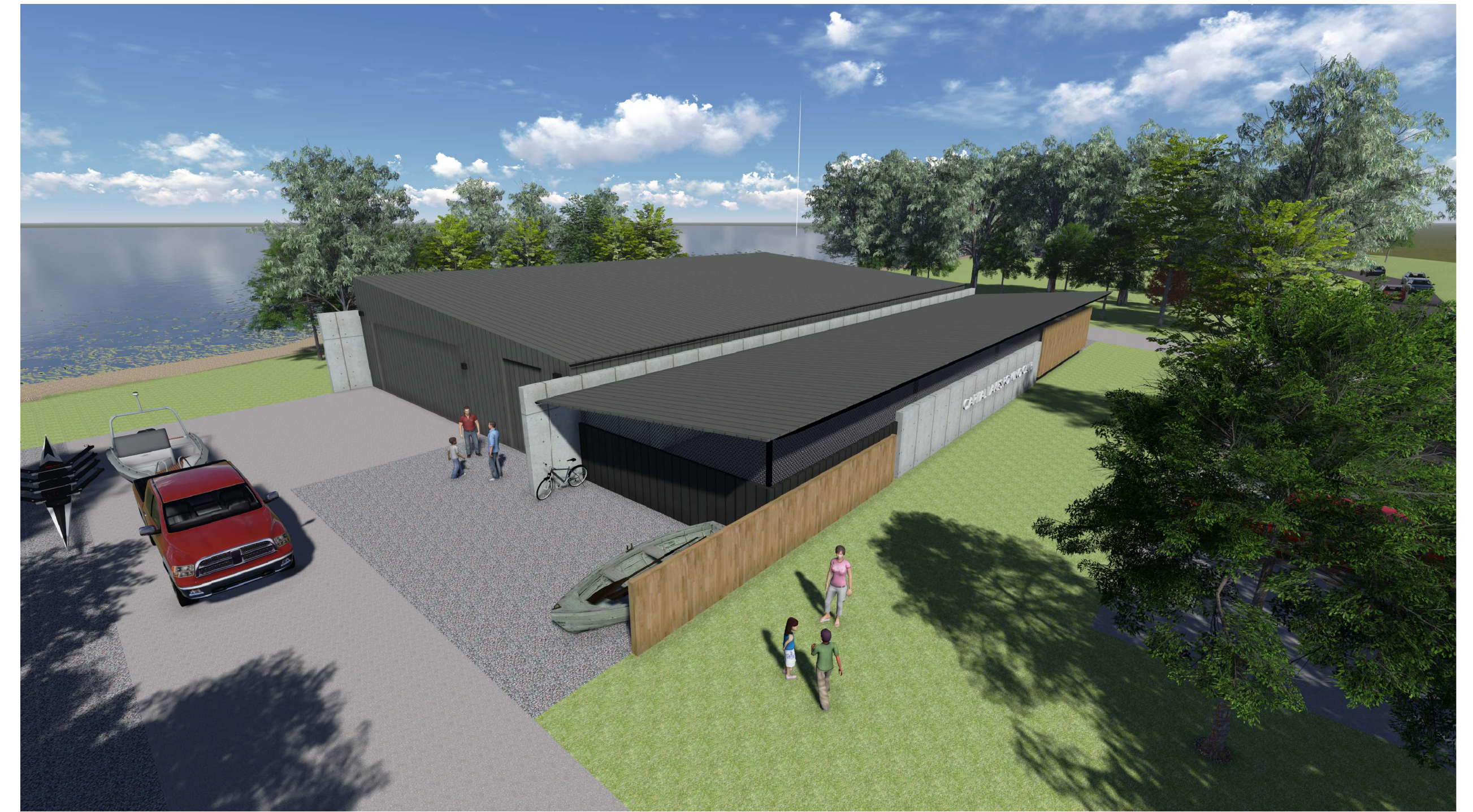
2 PERSPECTIVE TWO FROM THE DRIVE WAY