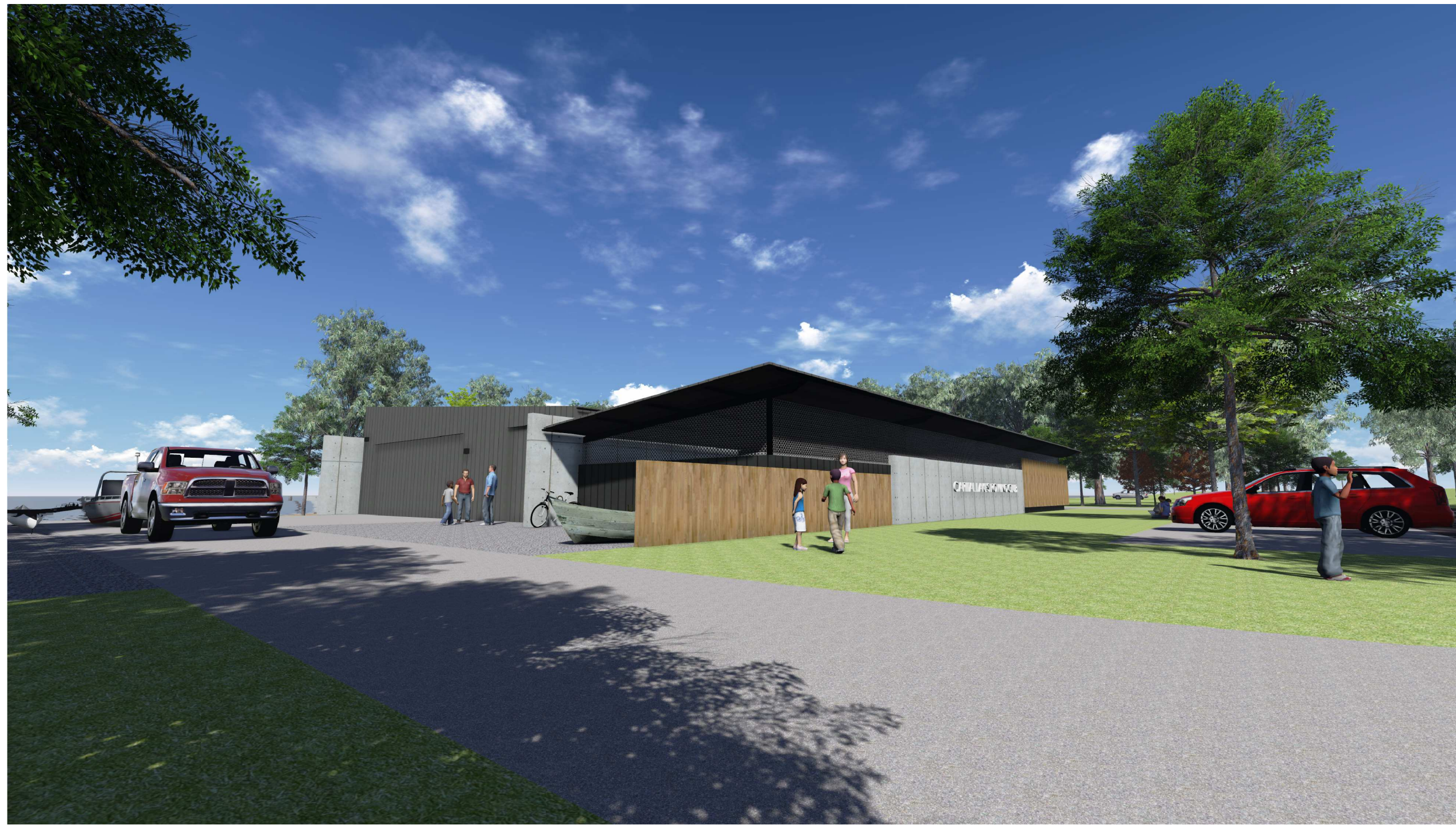
1 PERSPECTIVE ONE FROM THE DRIVE WAY