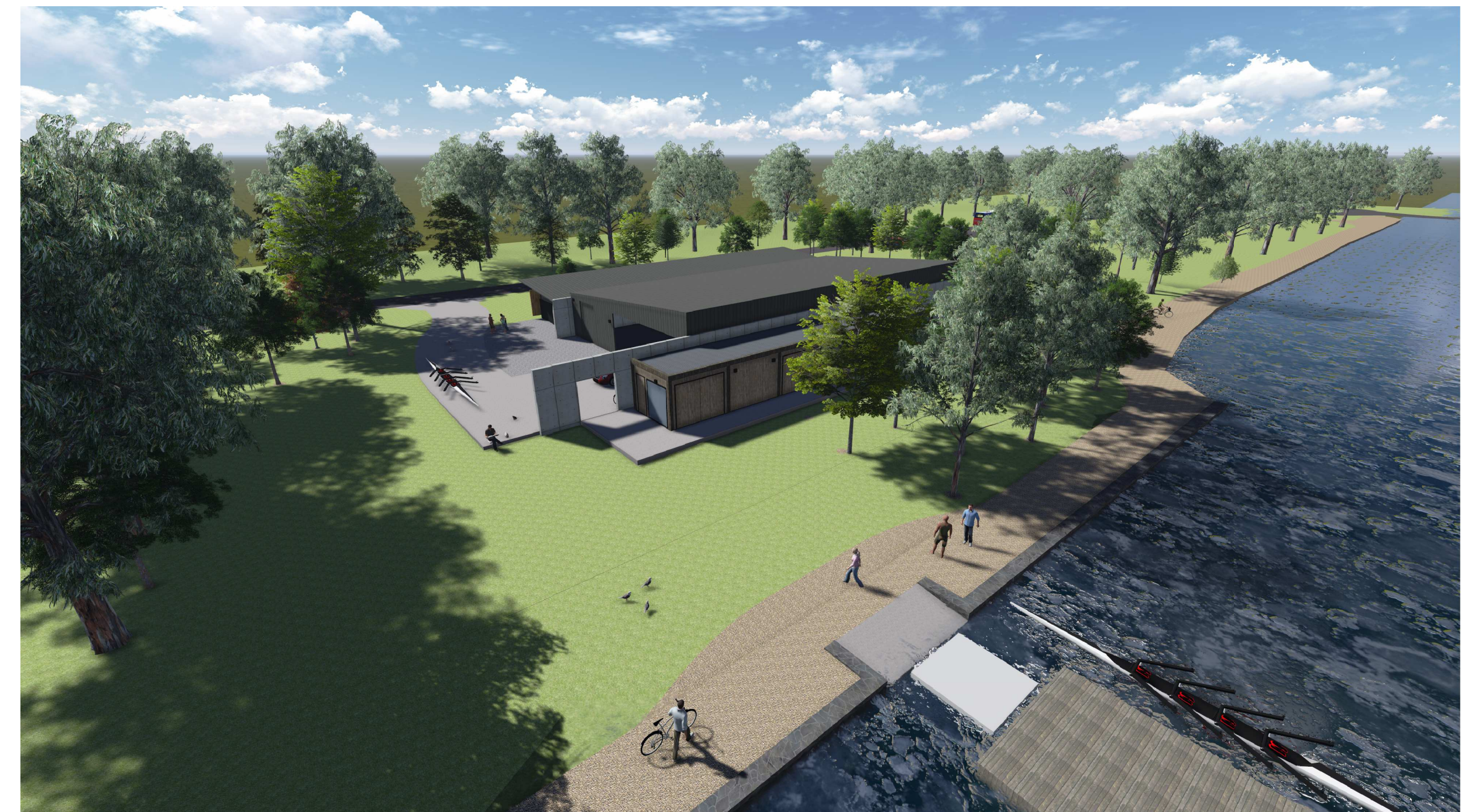
4 AERIAL VIEW